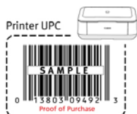
Sample Printer 12-Digit UPC Barcode