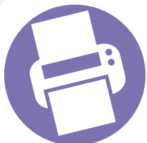
Epson Stylus Photo 1400, R1900 or R2880

Buy an Epson Stylus ® Photo 1400, R1900 or R2880, together with any 6-megapixel or above digital camera or Apple ® computer or notebook