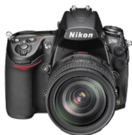
Nikon D700 12.1 MP Full Frame DSLR

Pick up Friday after noon and return Monday before noon and pay for only one day !!