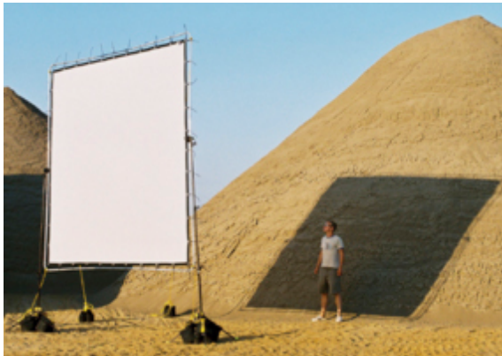
12'x12' California Sunbounce Scrim Includes 2/3 stop seamless screen, frame, 2 gripheads, bungee snakes, case $60.00 $180.00