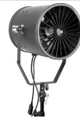
Bowens Jet Stream w/stand $30.00 $90.00